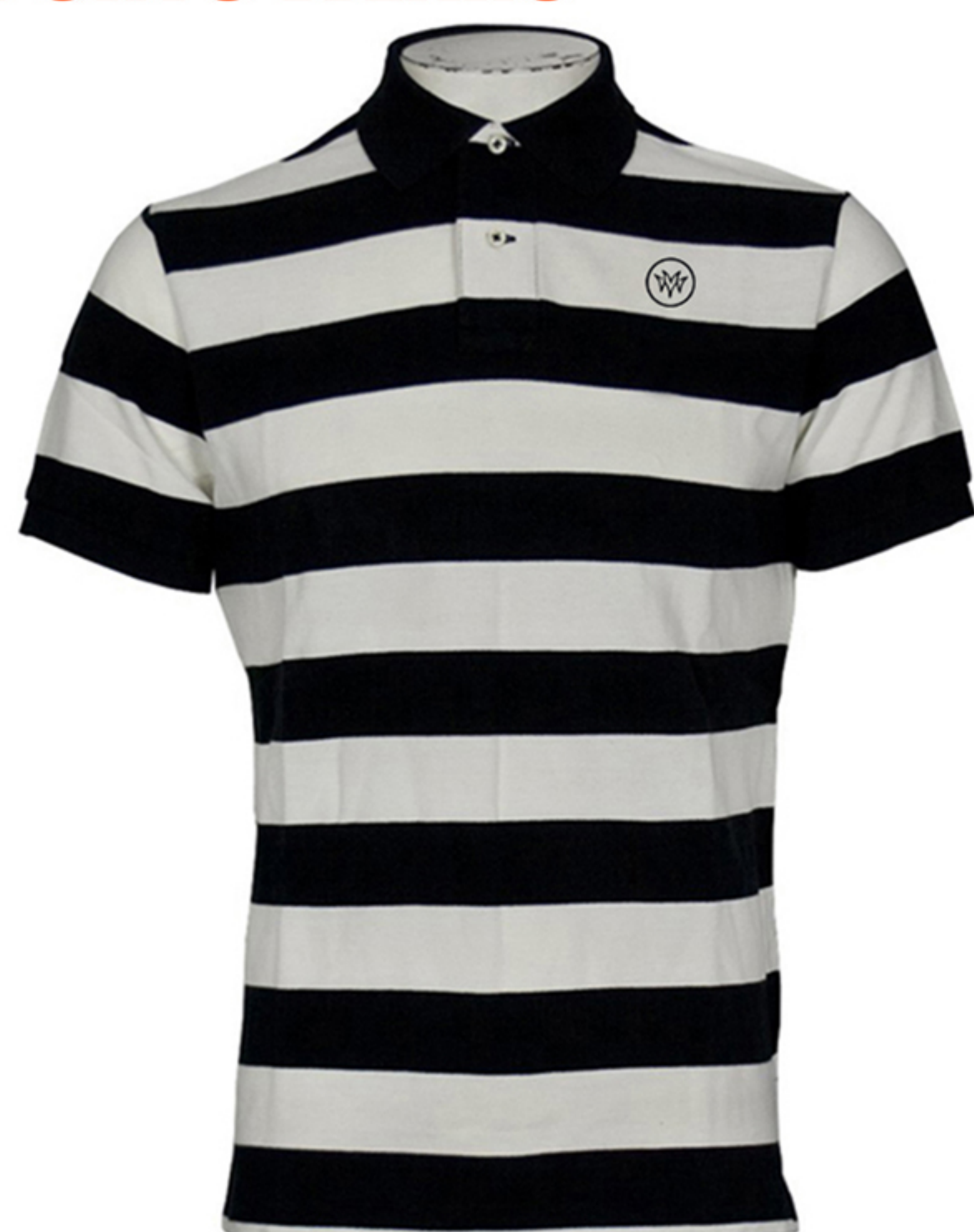
POLO SHIRT MM-PS-531