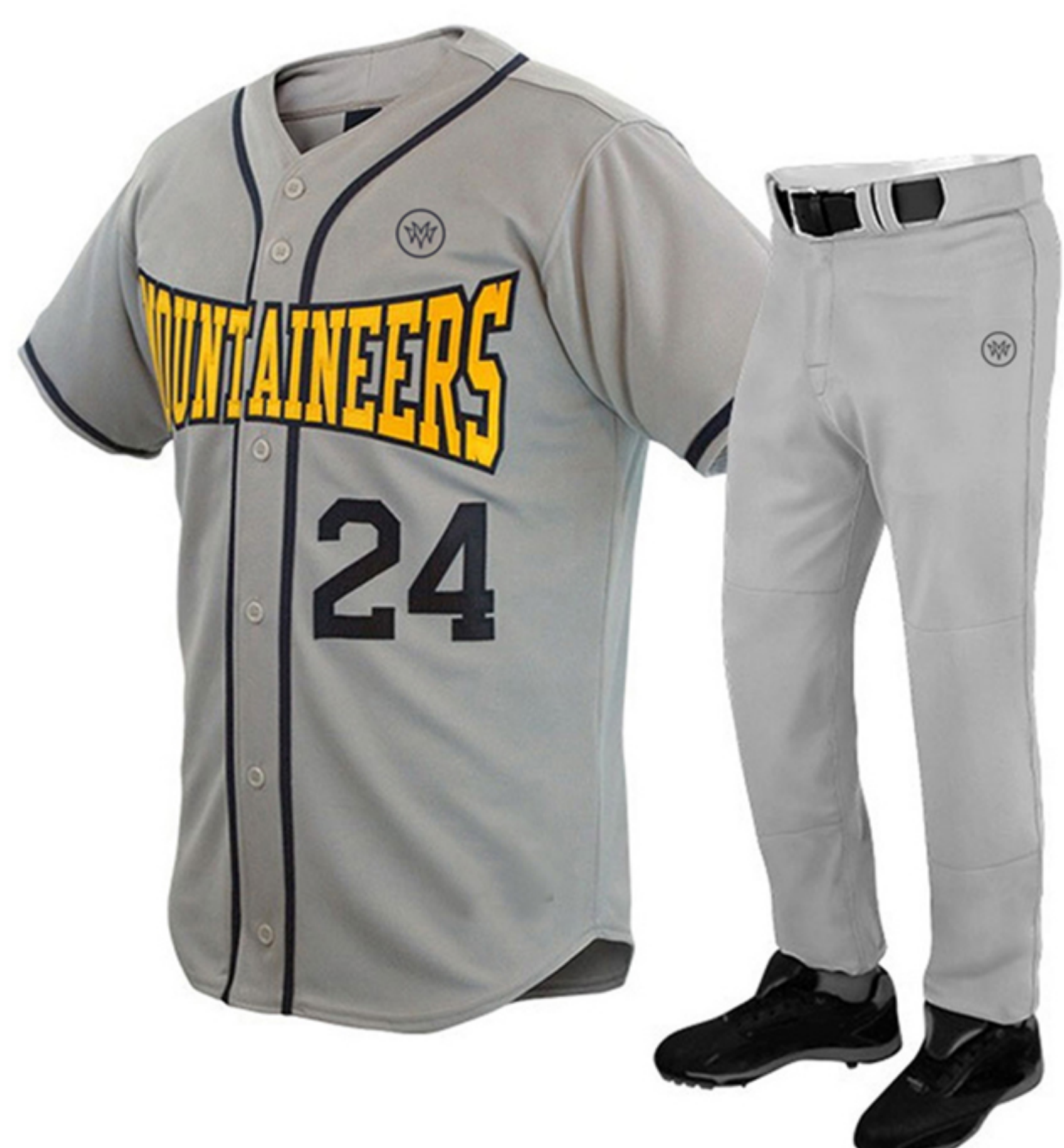
BASEBALL UNIFORM MM-BU-001