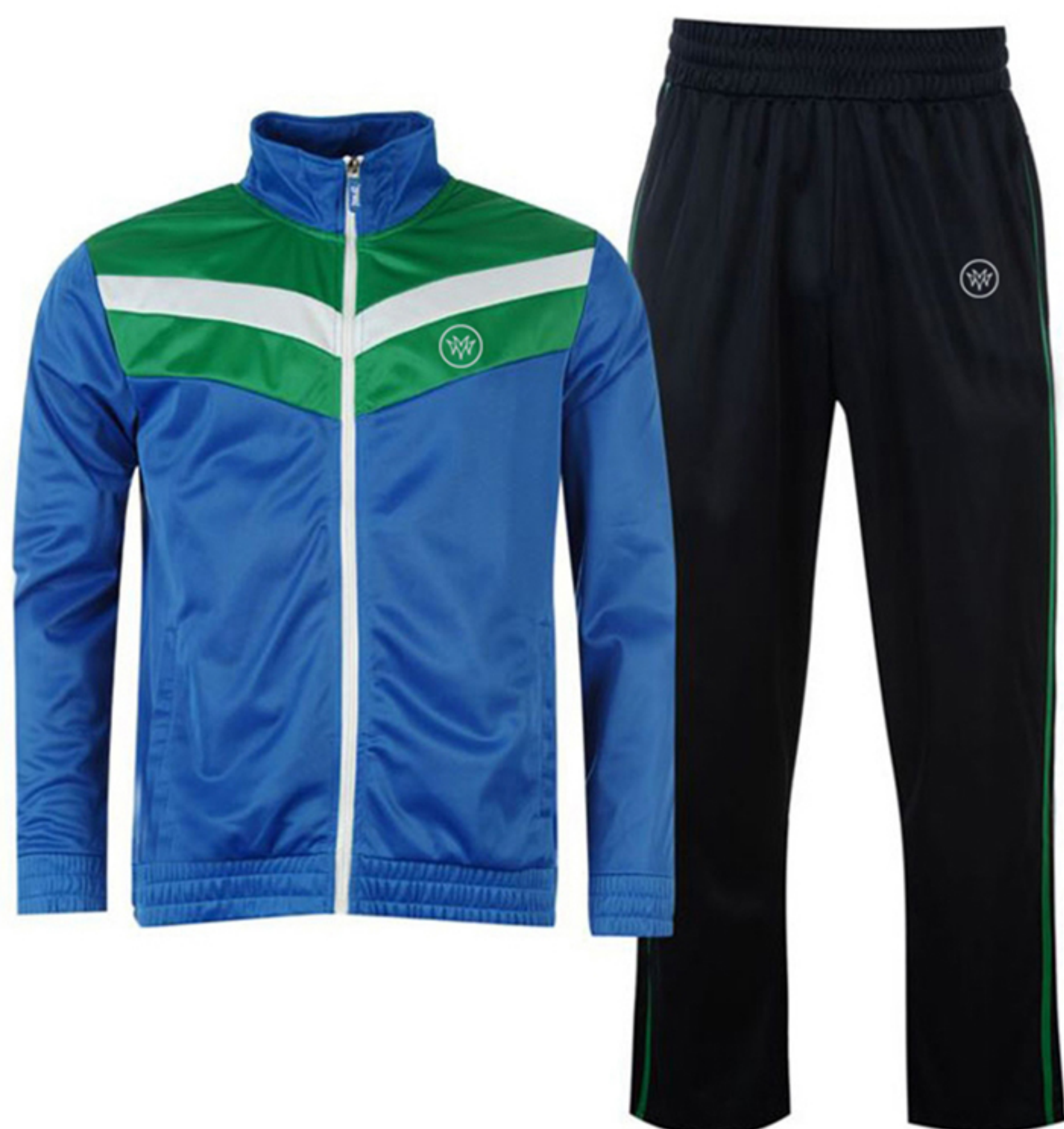
TRACK SUITS MM-TS-747