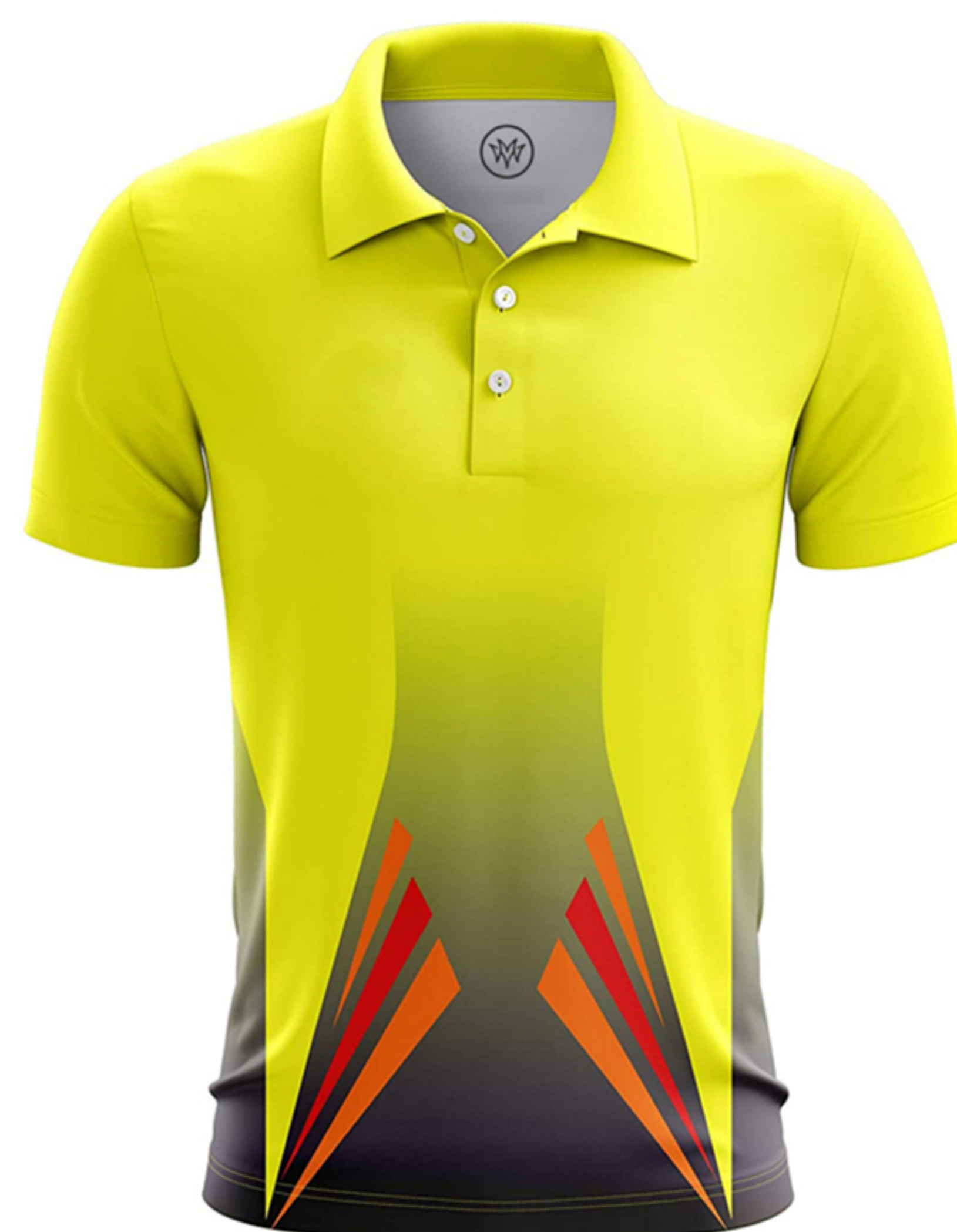
SOCCER JERSEY MM-SJ-640