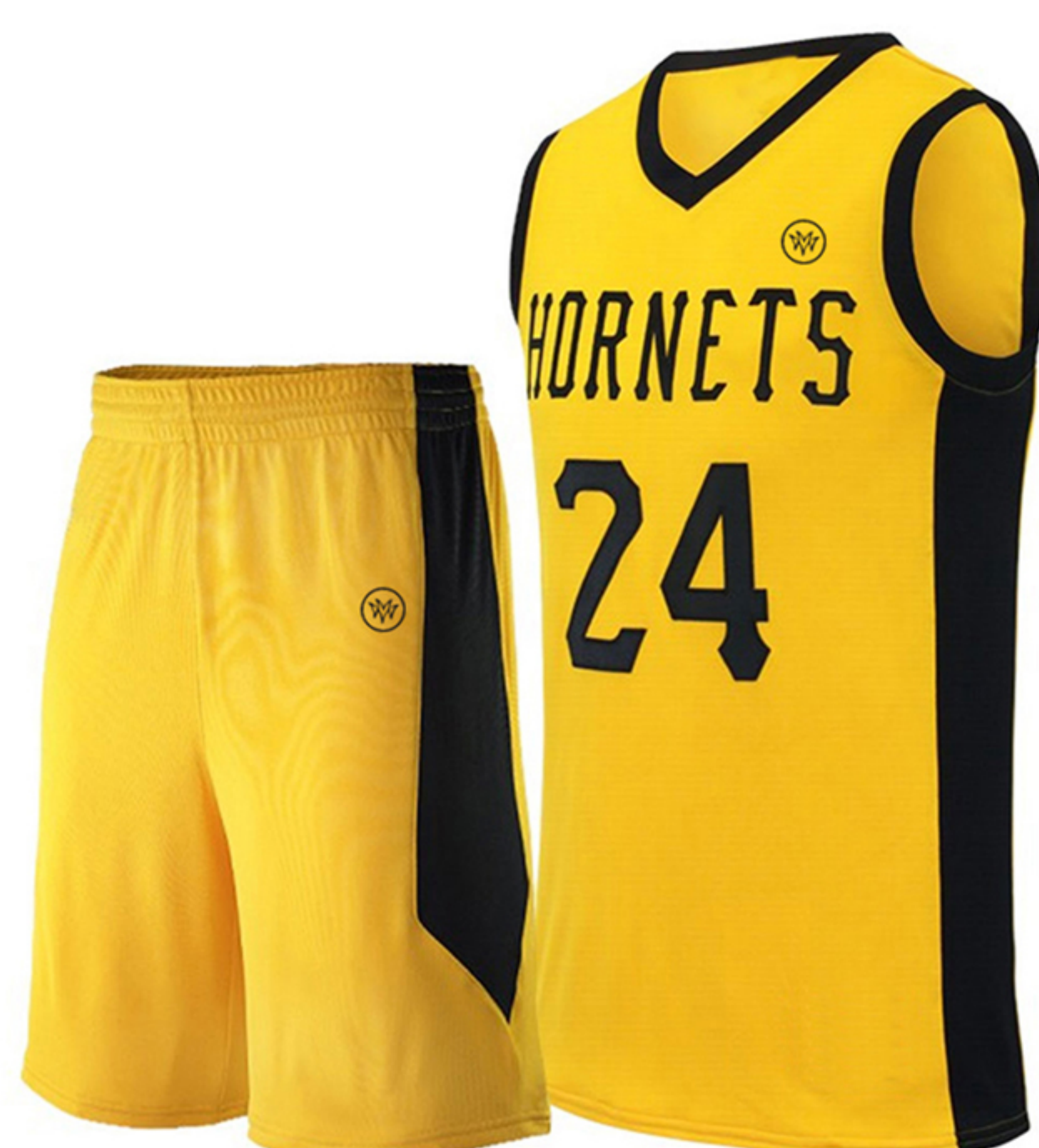
BASKETBALL UNIFORMS MM-BU-109