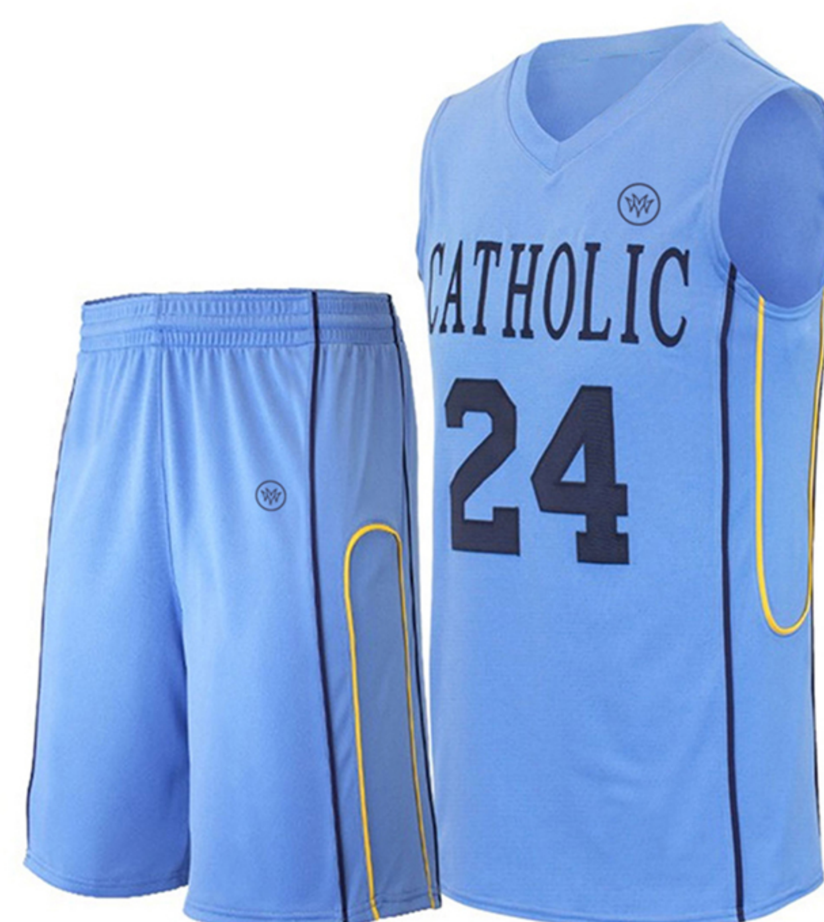
BASKETBALL UNIFORMS MM-BU-112