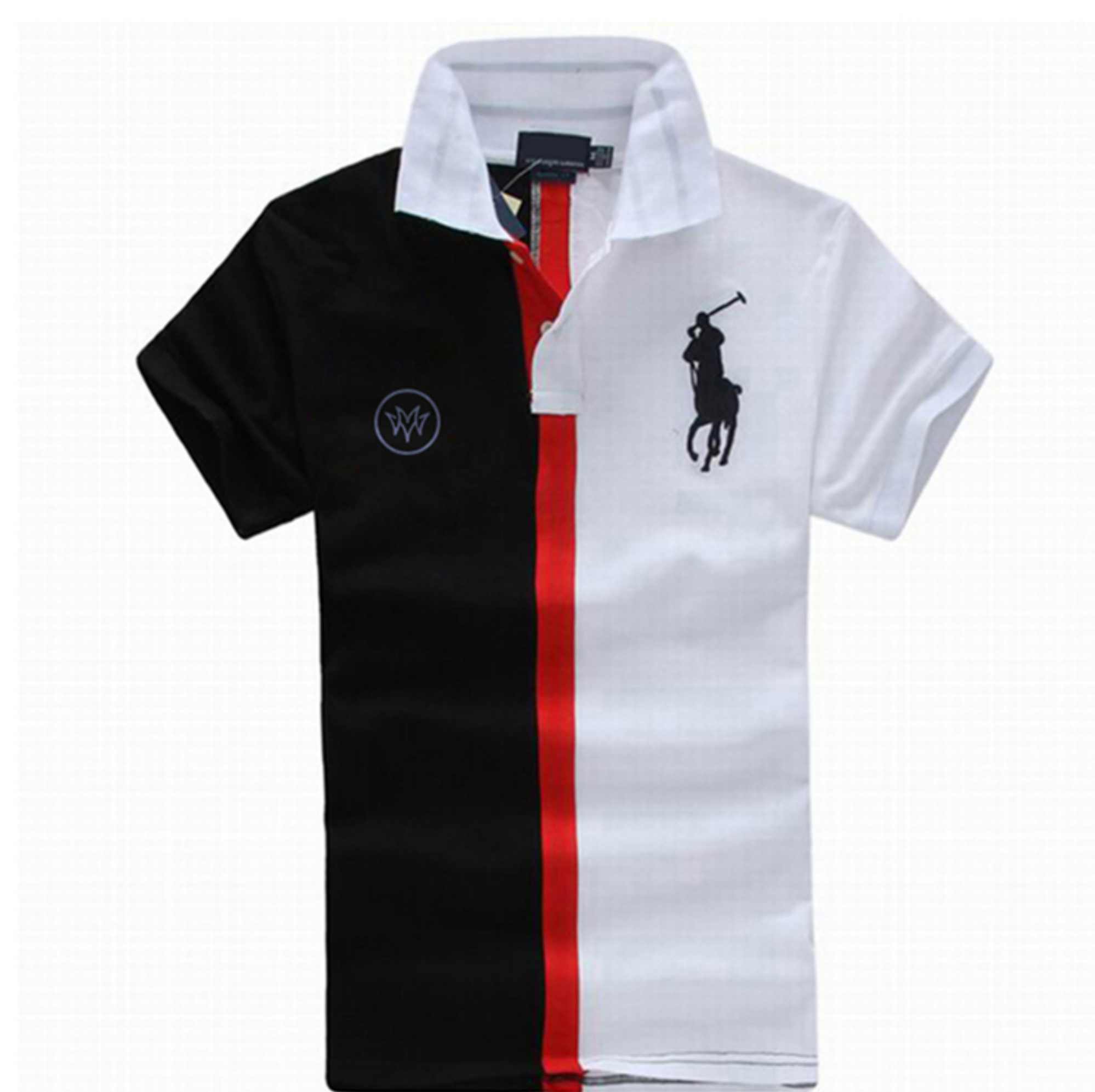
POLO SHIRT MM-PS-532