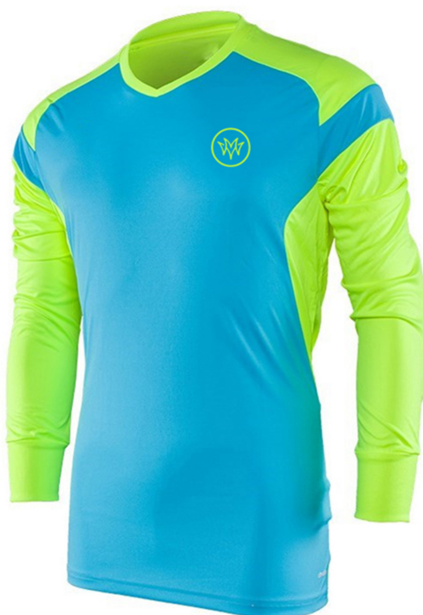
SOCCER JERSEY MM-SJ-639