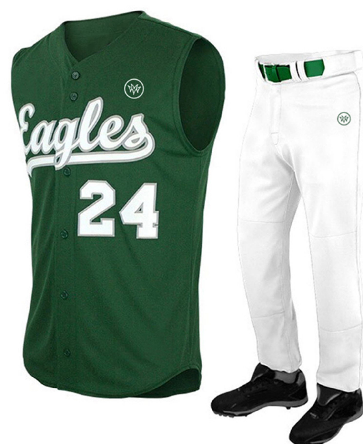
BASEBALL UNIFORM MM-BU-002