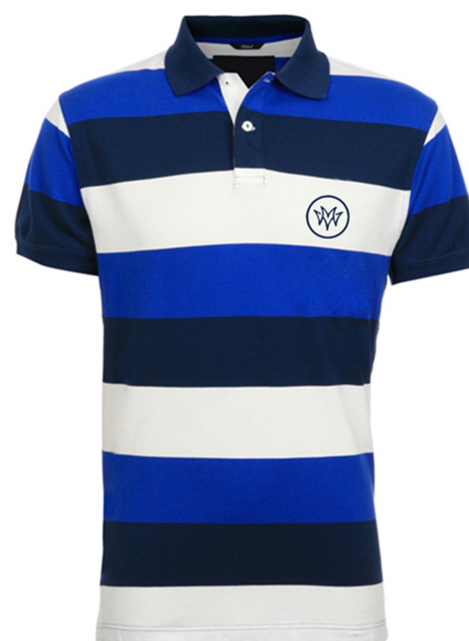
POLO SHIRT MM-PS-534