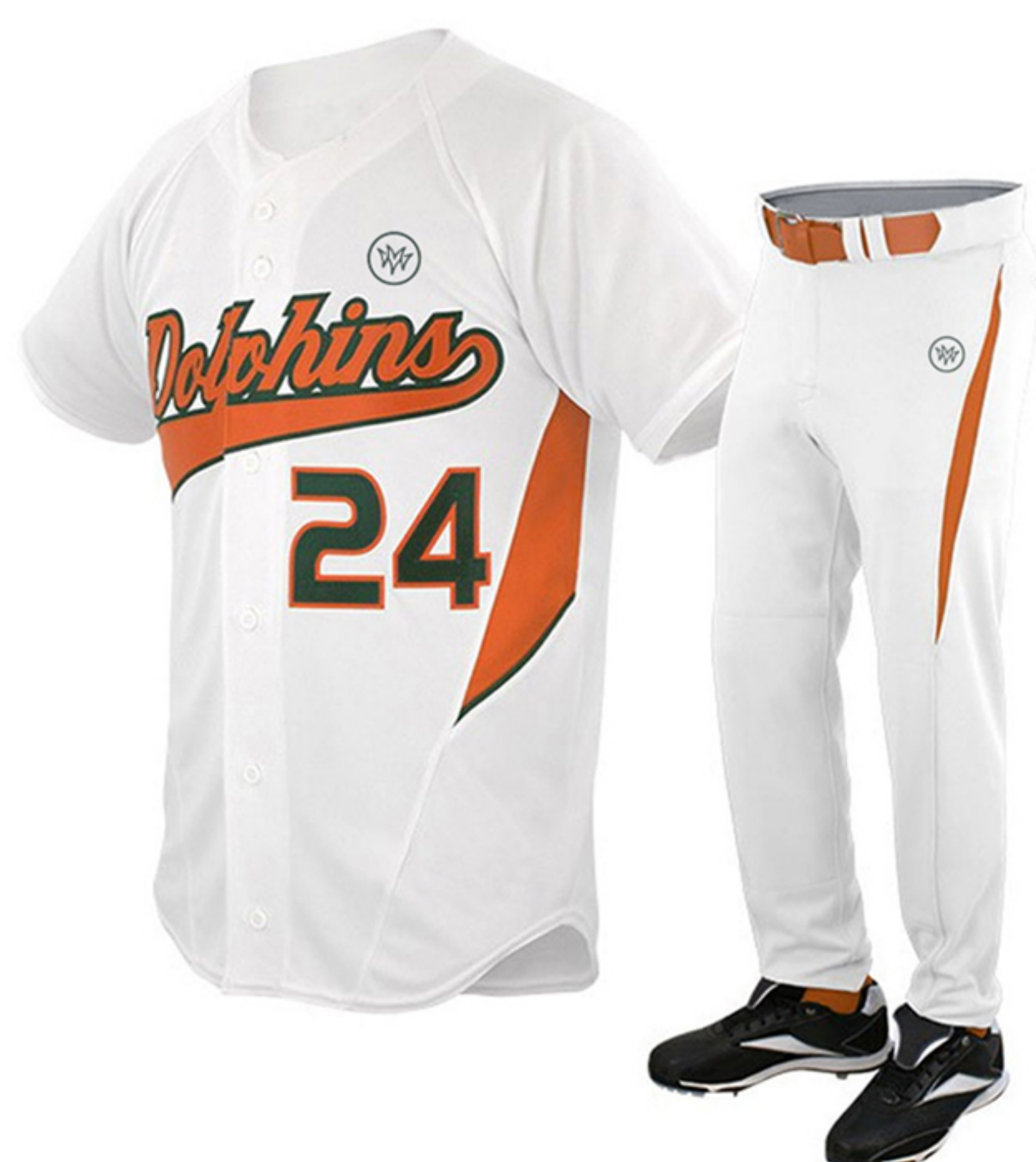
BASEBALL UNIFORM MM-BU-005