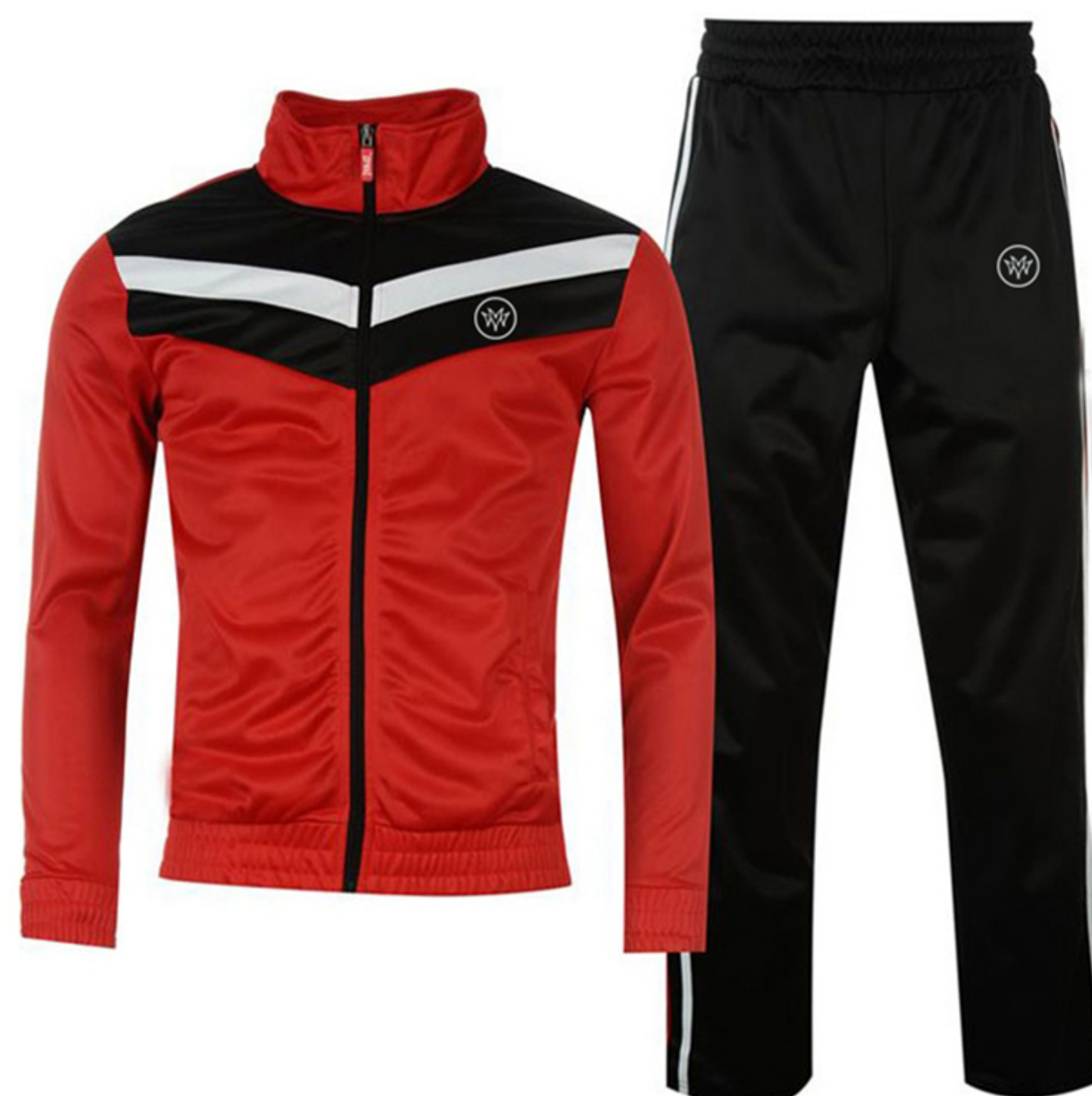
TRACK SUITS MM-TS-748