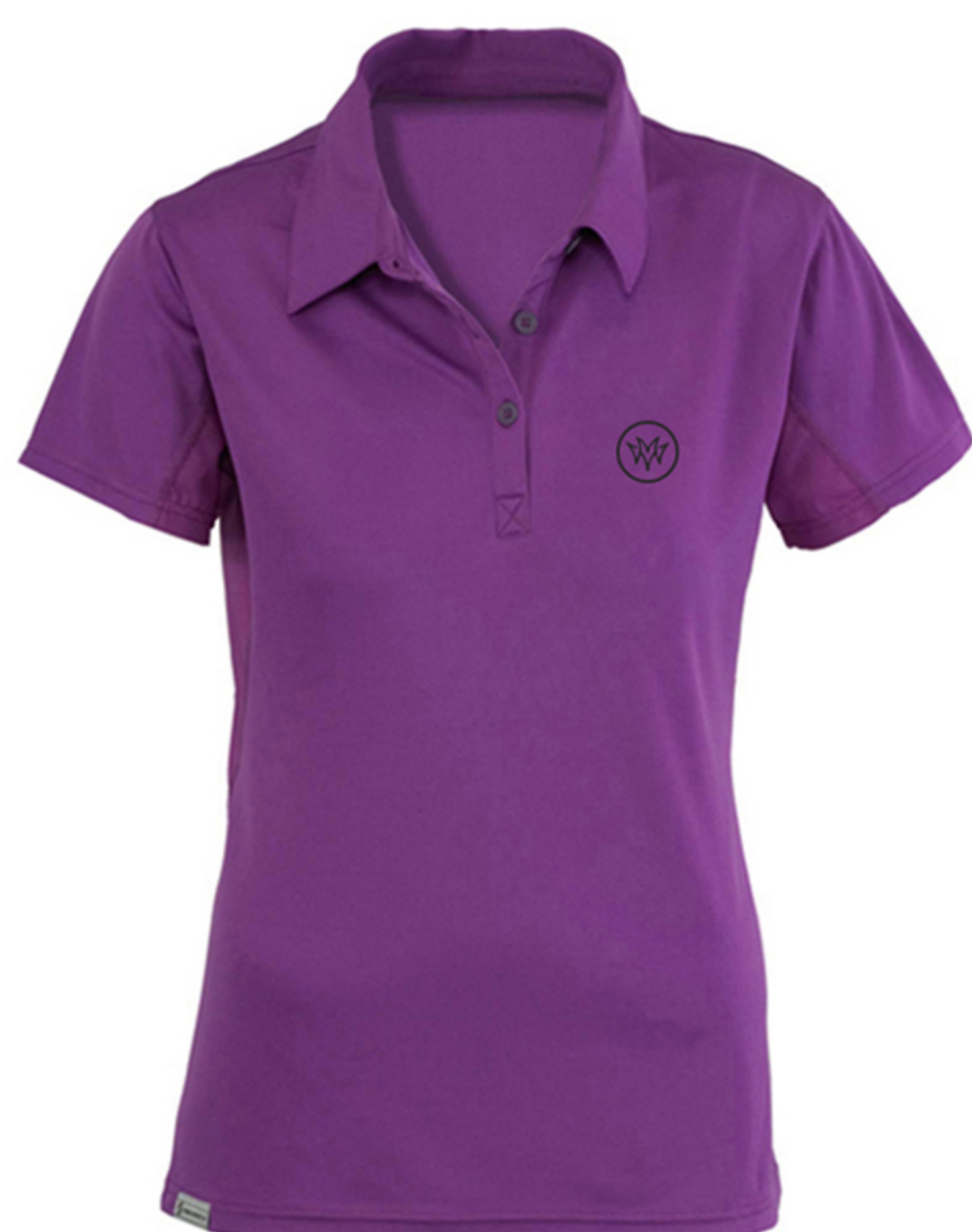
POLO SHIRT MM-PS-533