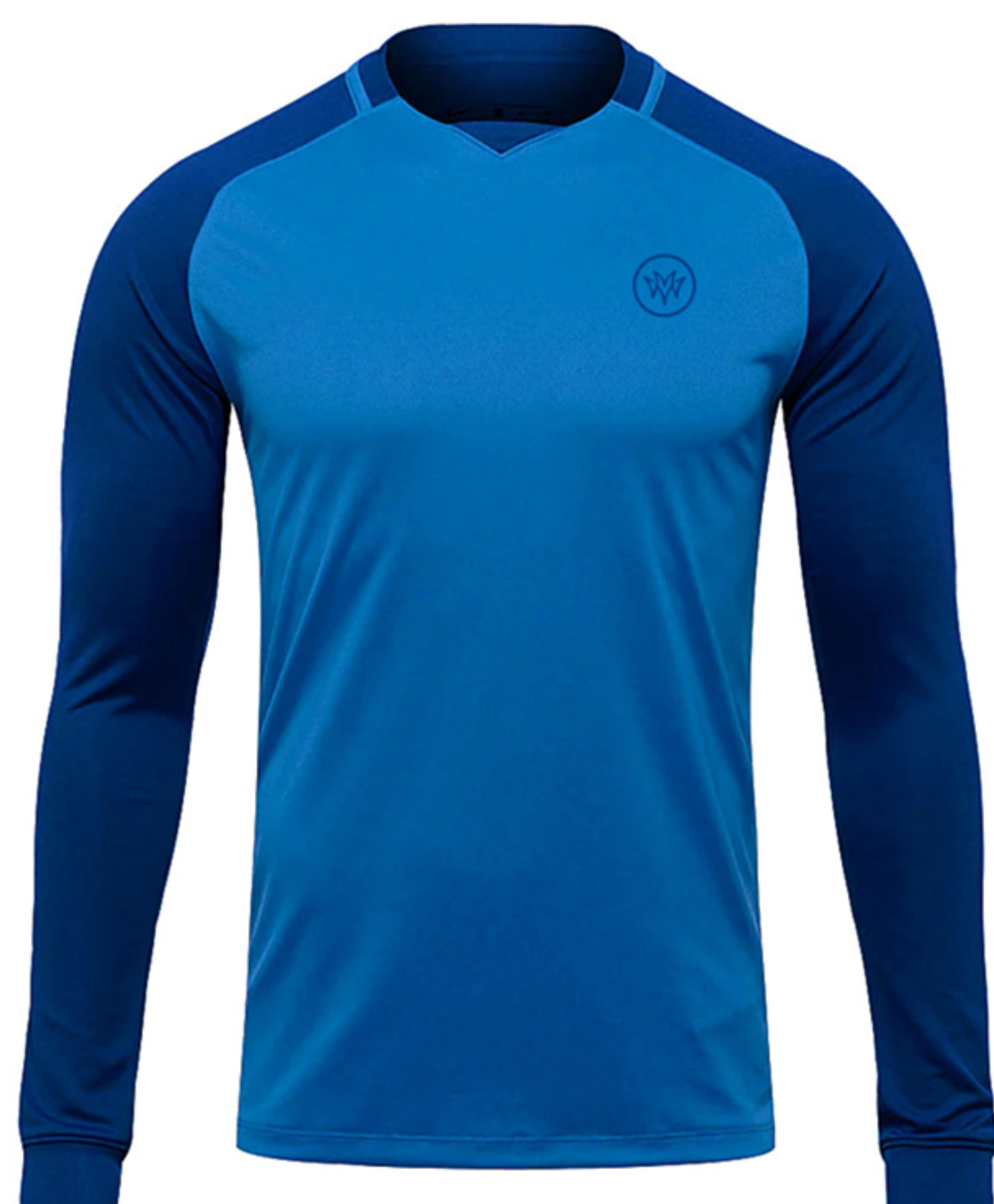
SOCCER JERSEY MM-SJ-637