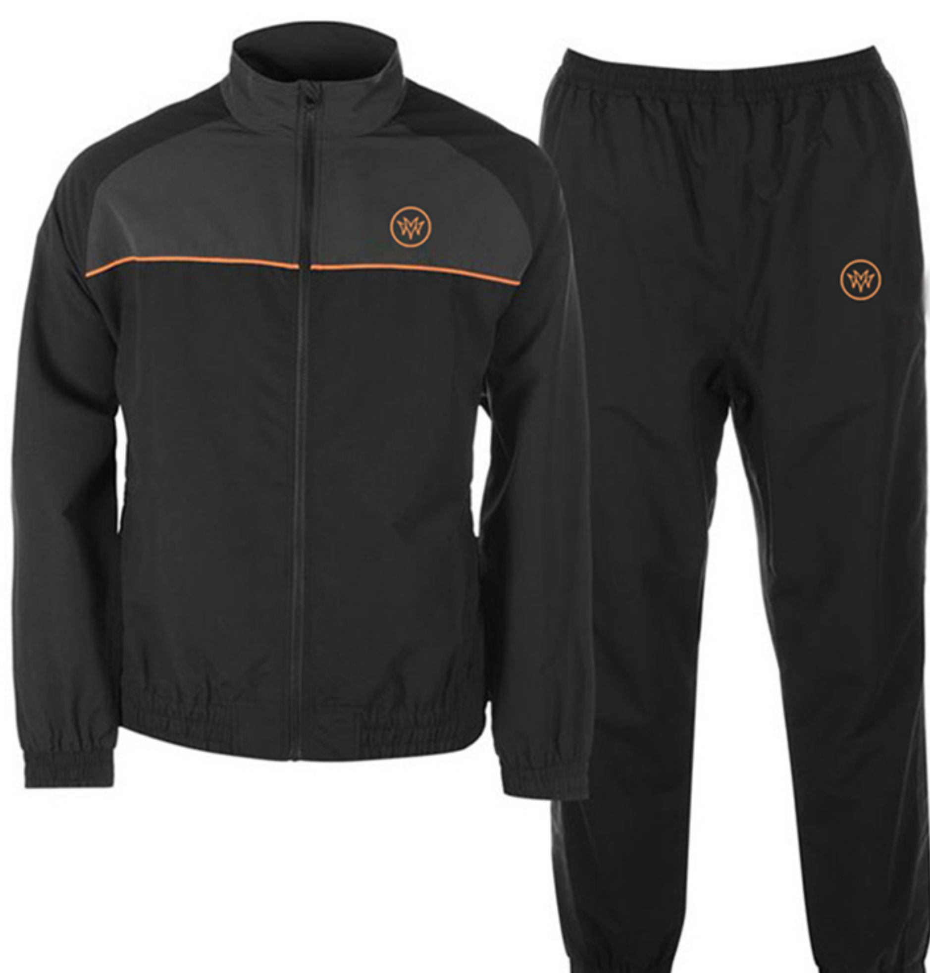
TRACK SUITS MM-TS-743