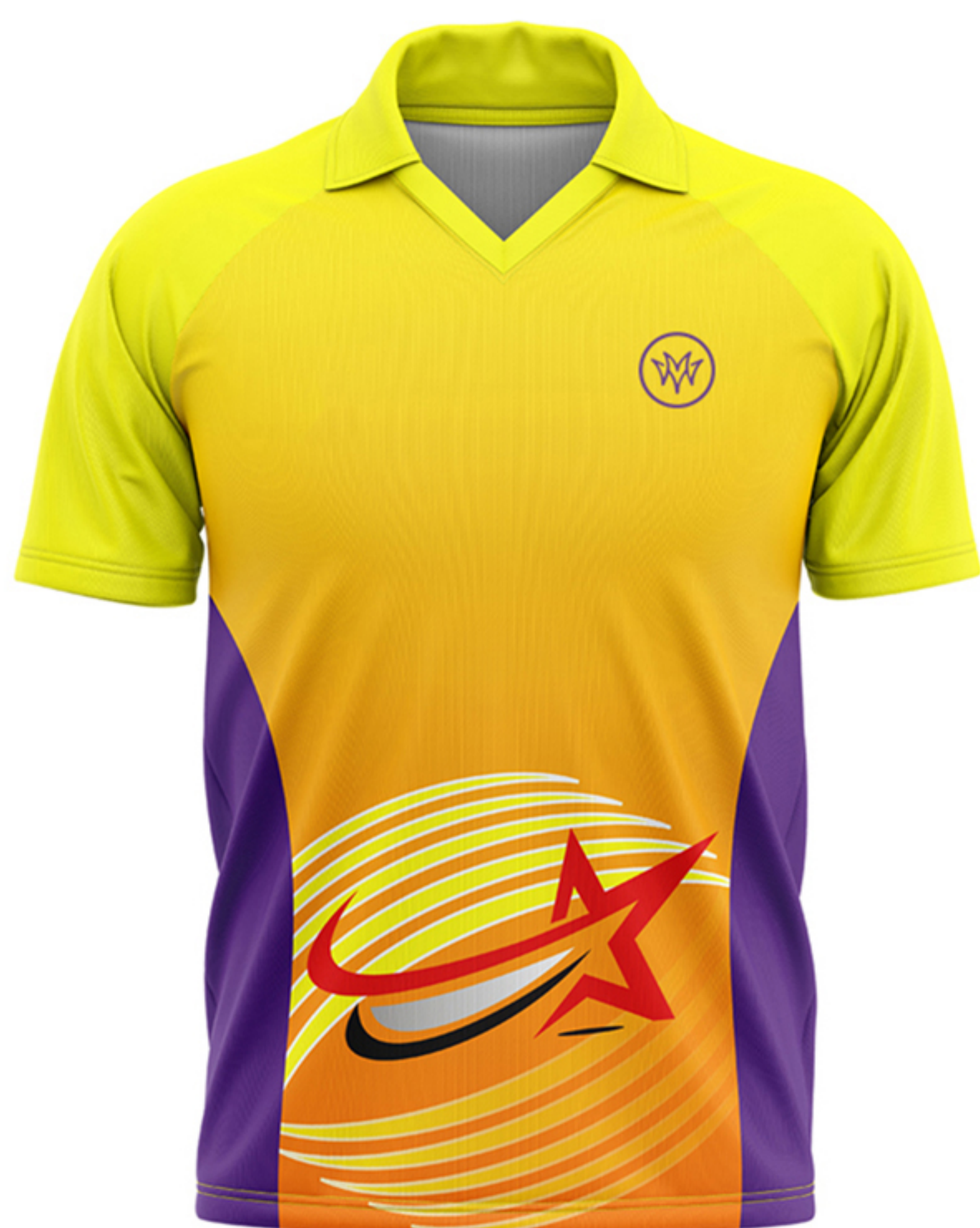
SOCCER JERSEY MM-SJ-641