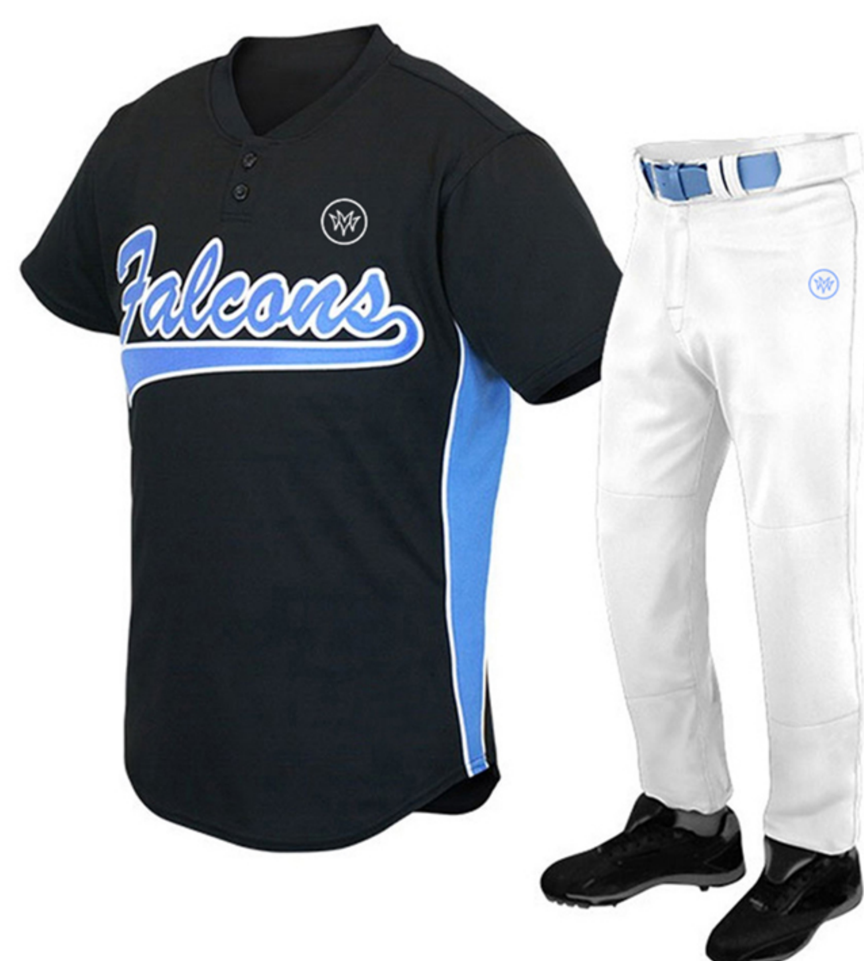
BASEBALL UNIFORM MM-BU-004