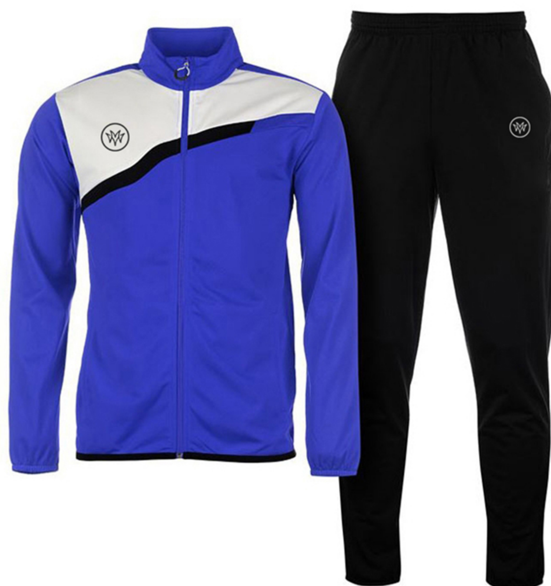
TRACK SUITS MM-TS-745