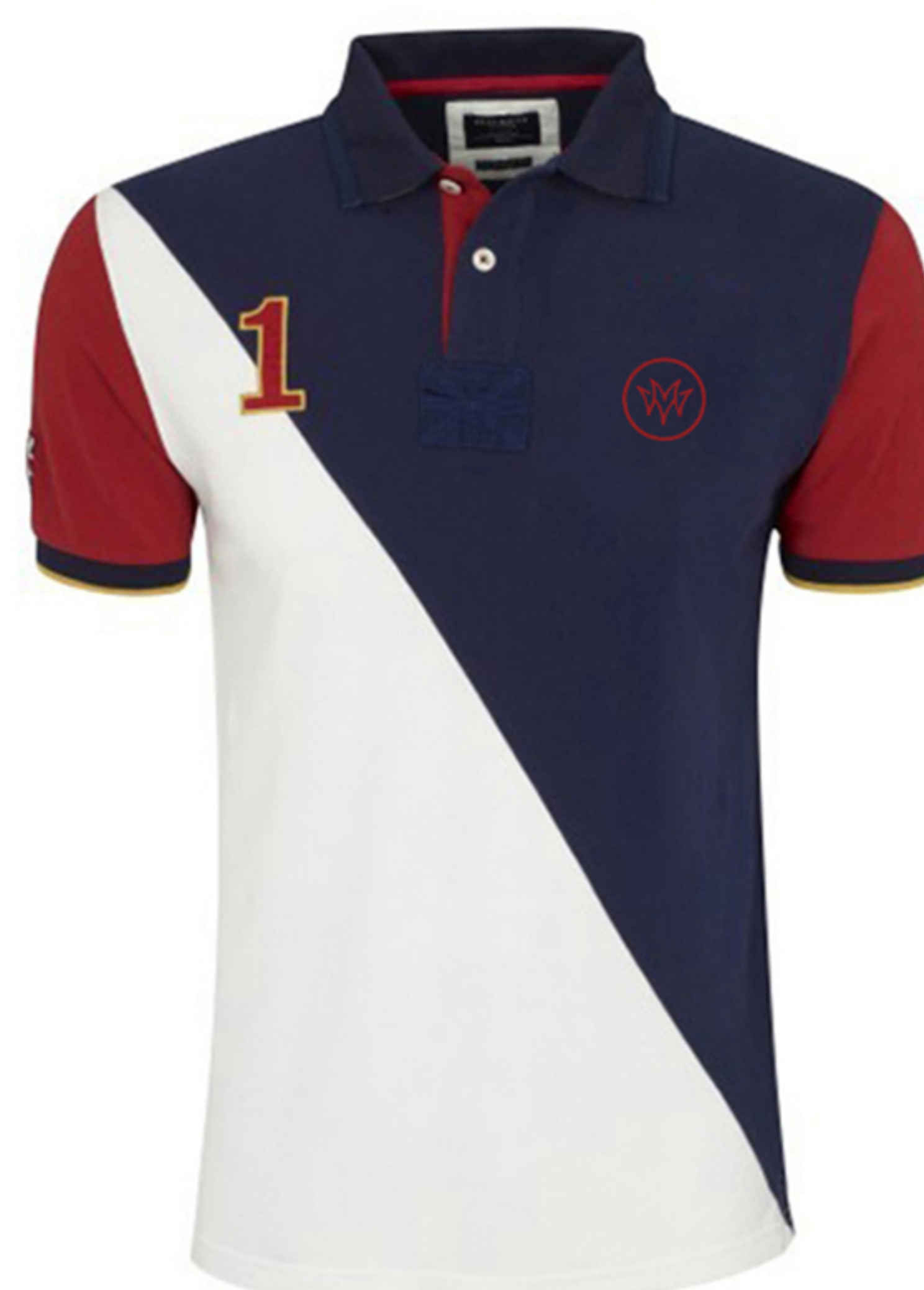
POLO SHIRT MM-PS-536