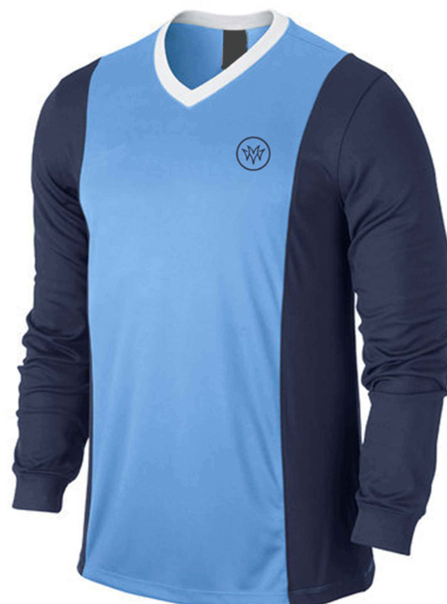
SOCCER JERSEY MM-SJ-638