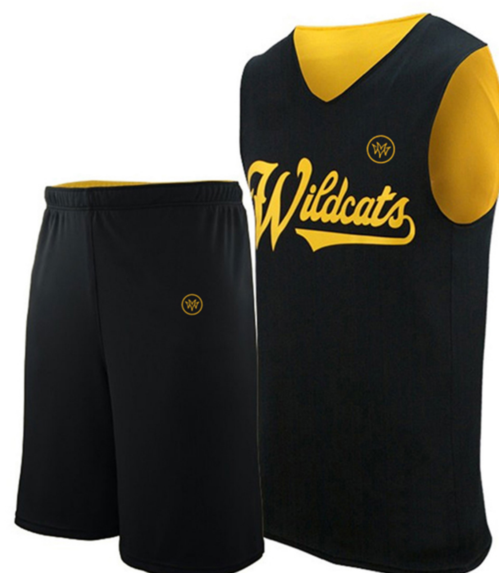
BASKETBALL UNIFORMS MM-BU-110