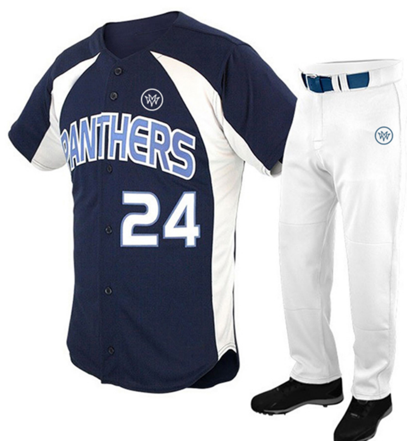
BASEBALL UNIFORM MM-BU-003