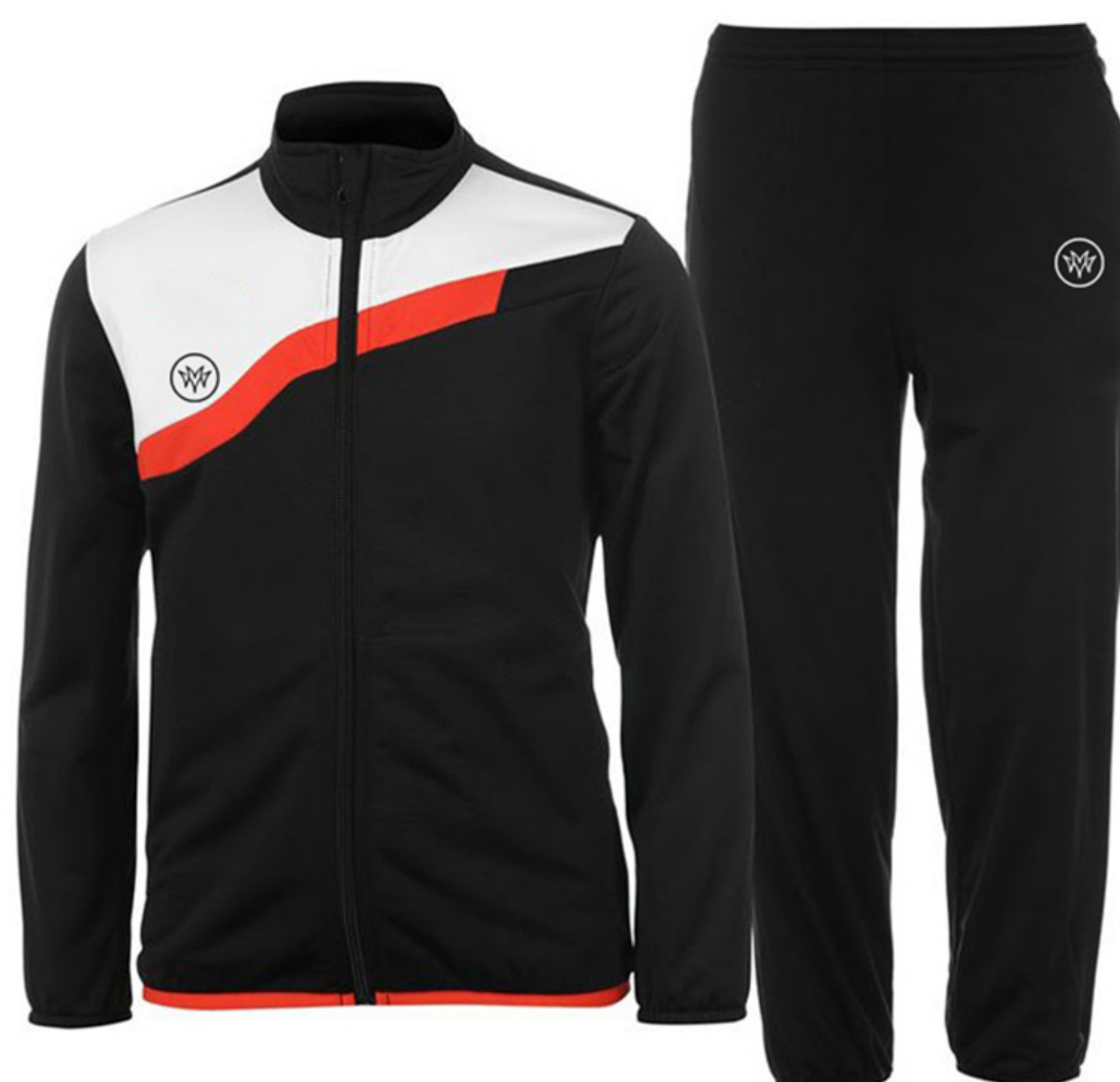
TRACK SUITS MM-TS-746