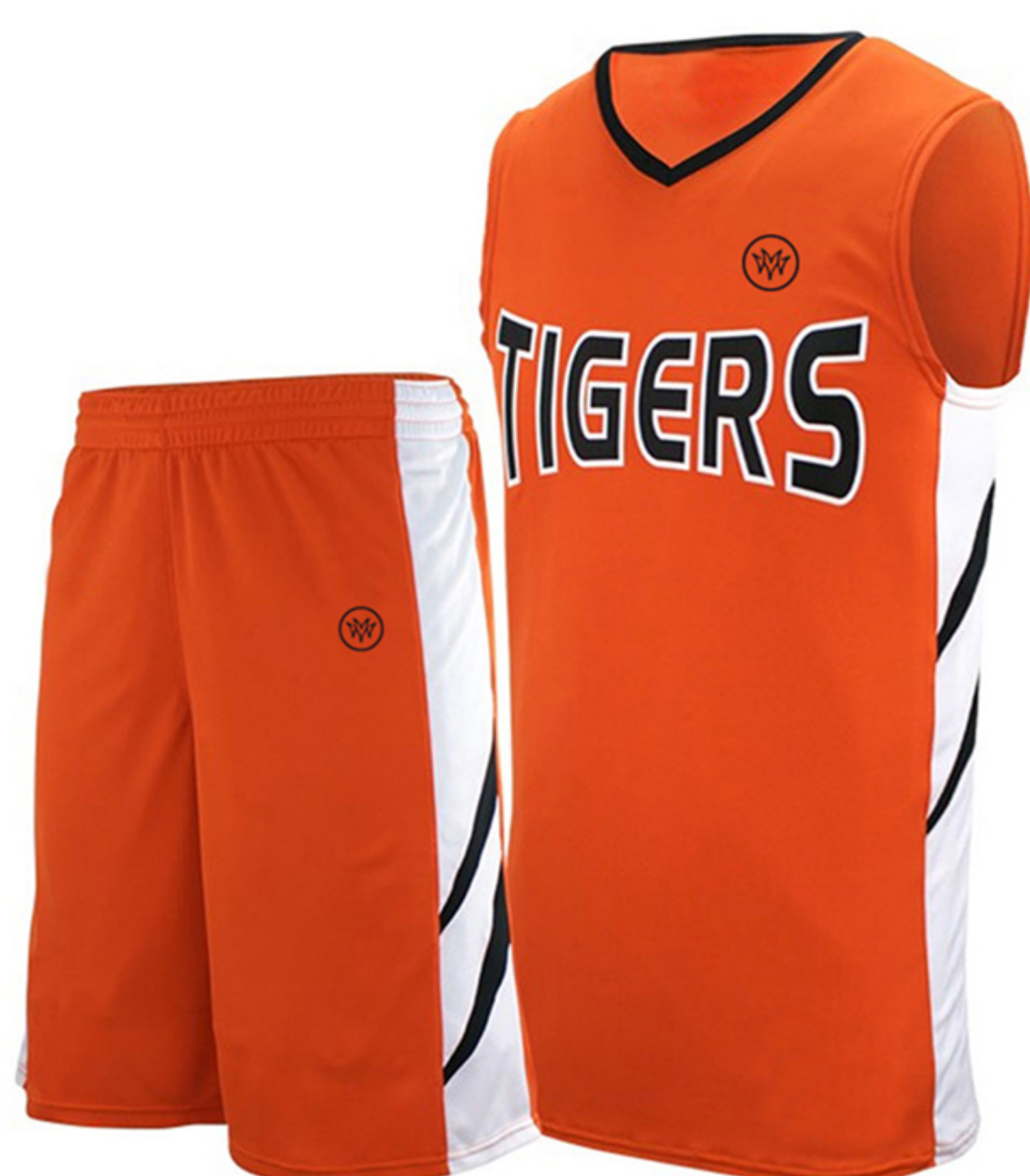
BASKETBALL UNIFORMS MM-BU-111