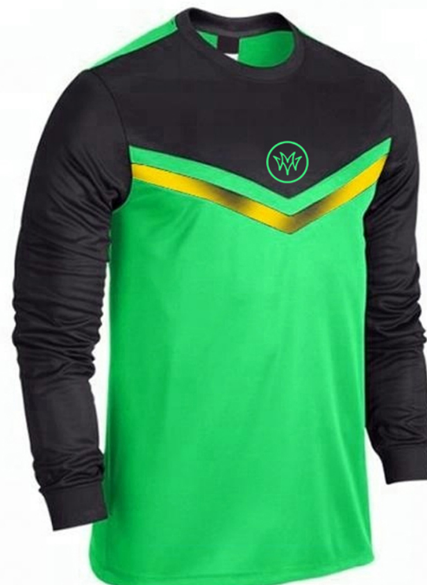
SOCCER JERSEY MM-SJ-642