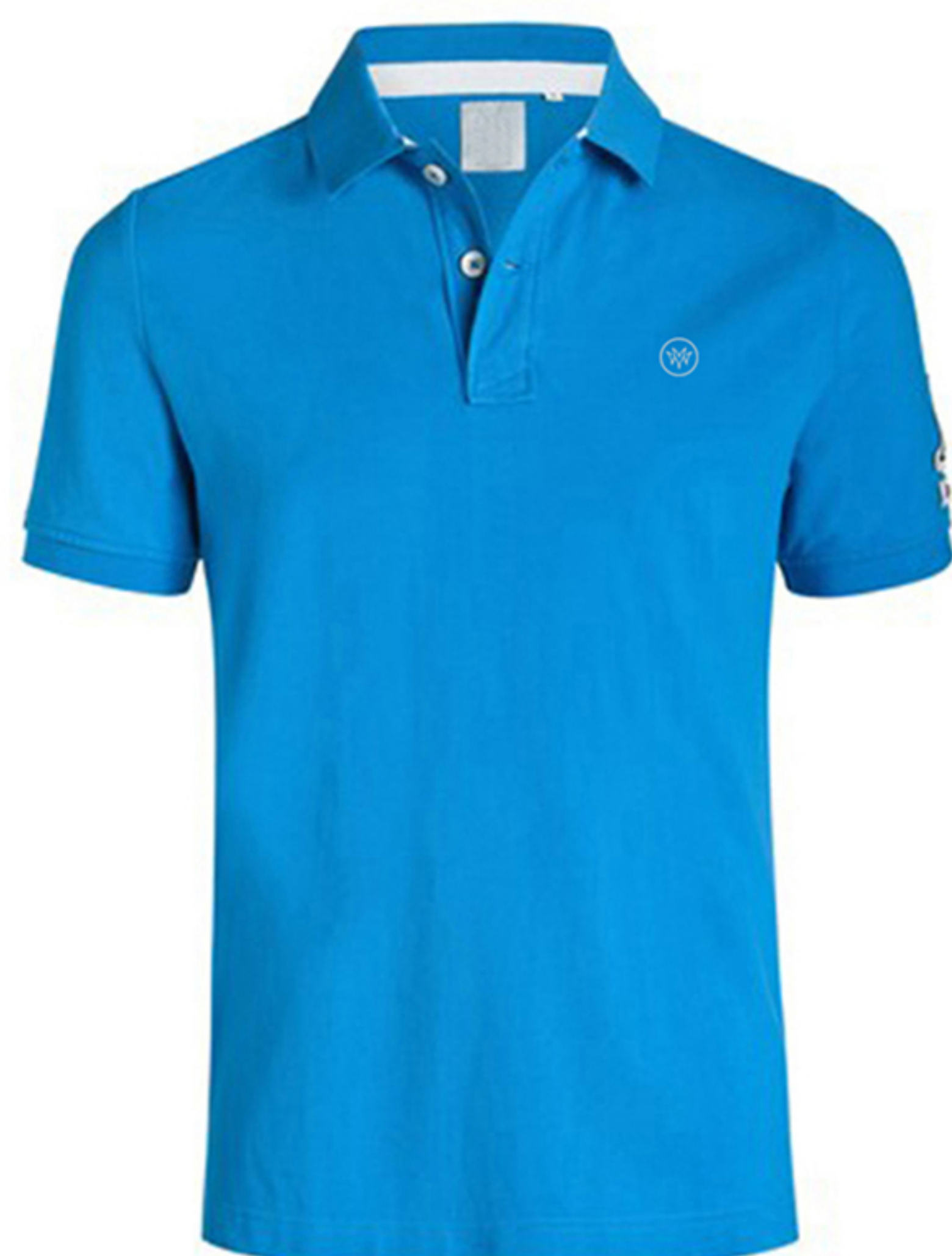
POLO SHIRT MM-PS-535