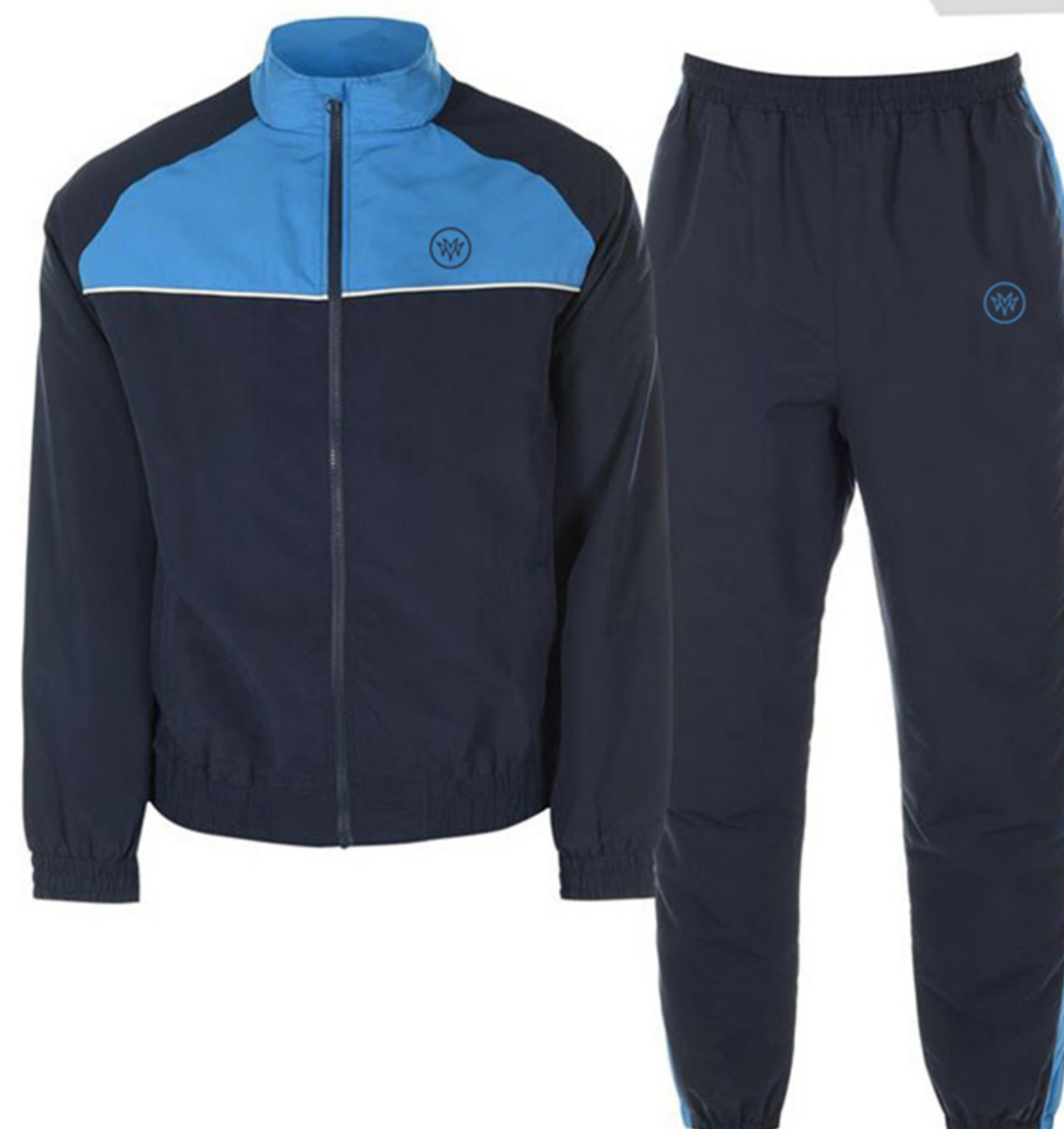
TRACK SUITS MM-TS-744