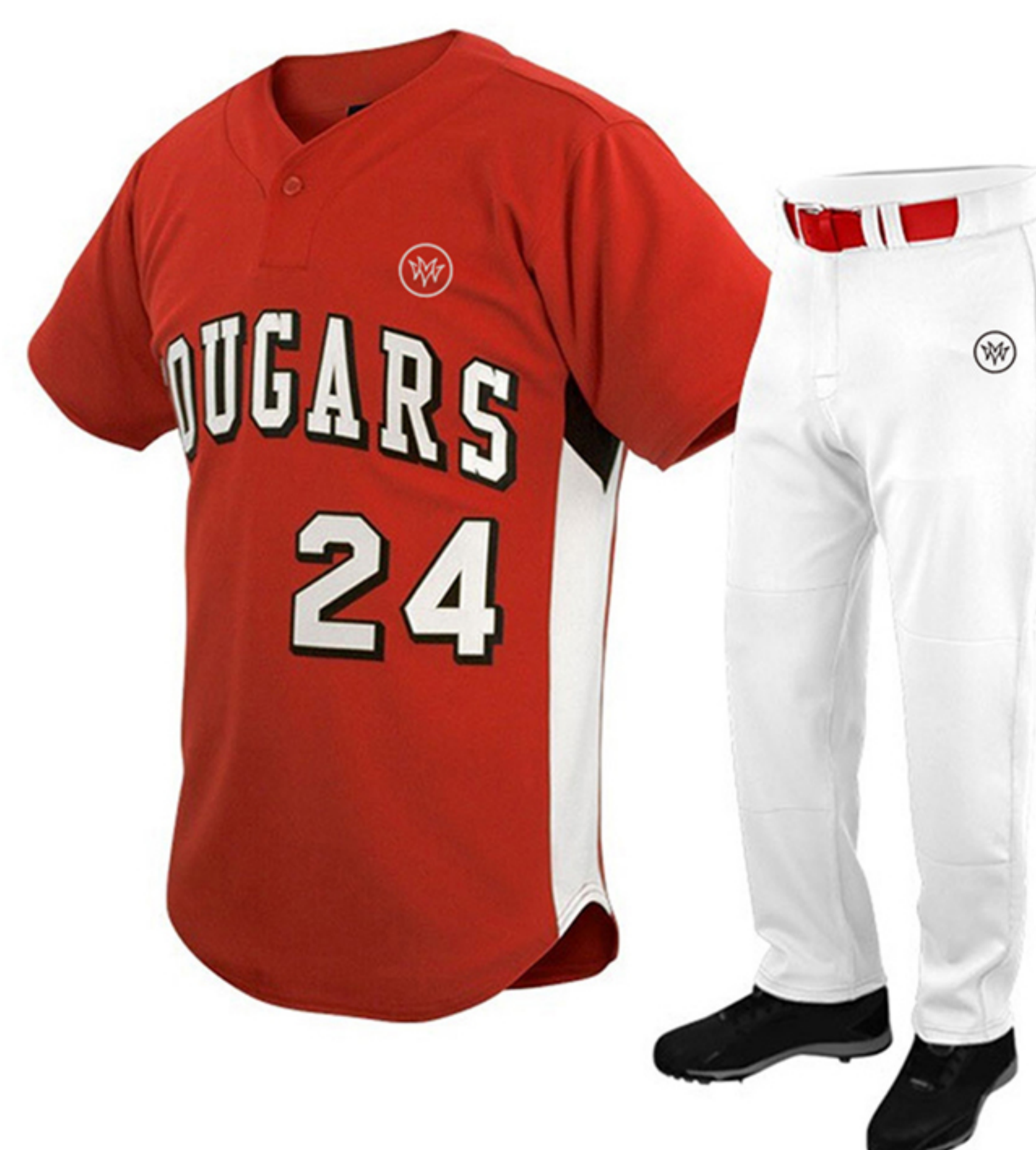
BASEBALL UNIFORM MM-BU-006