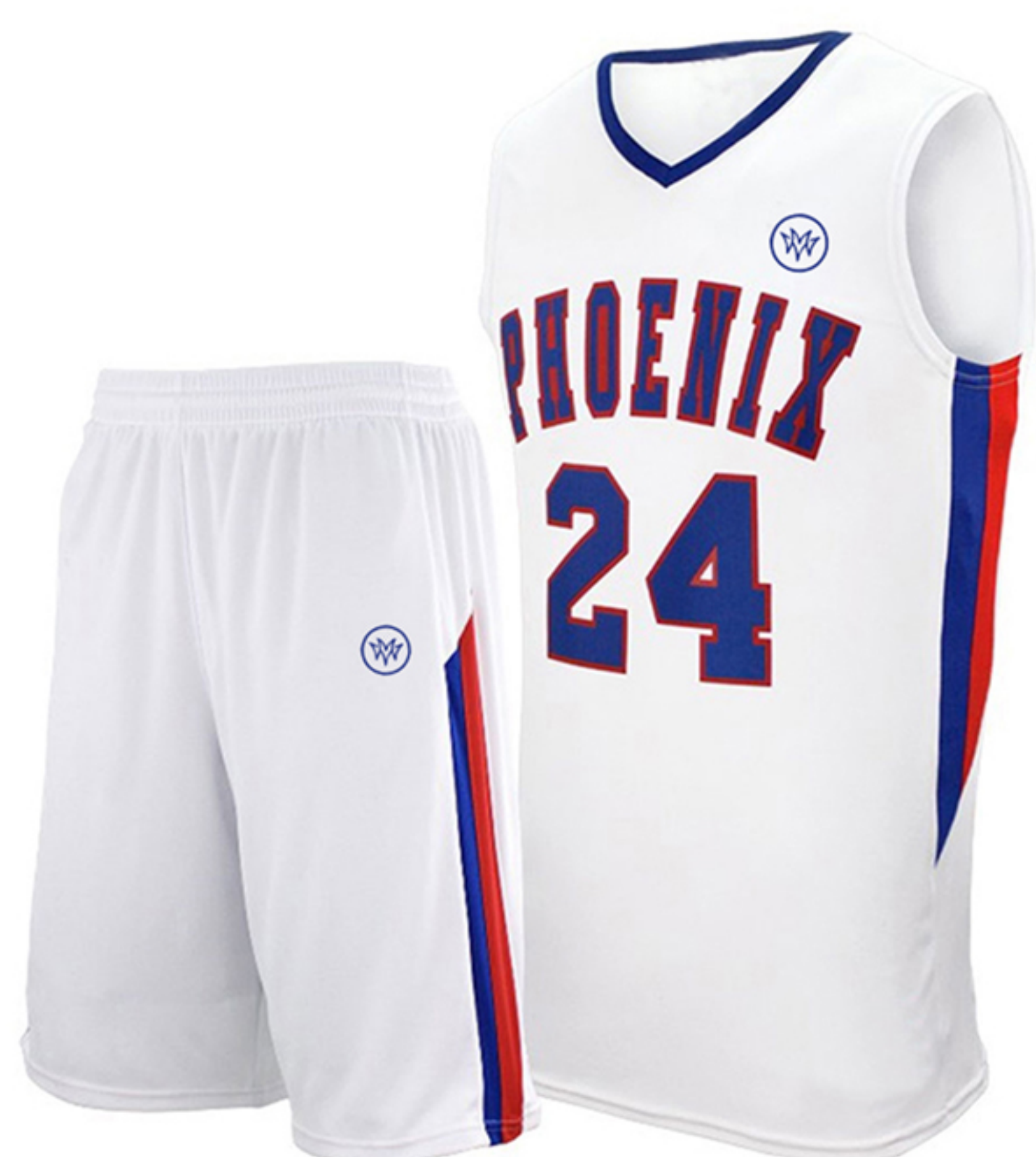
BASKETBALL UNIFORMS MM-BU-107