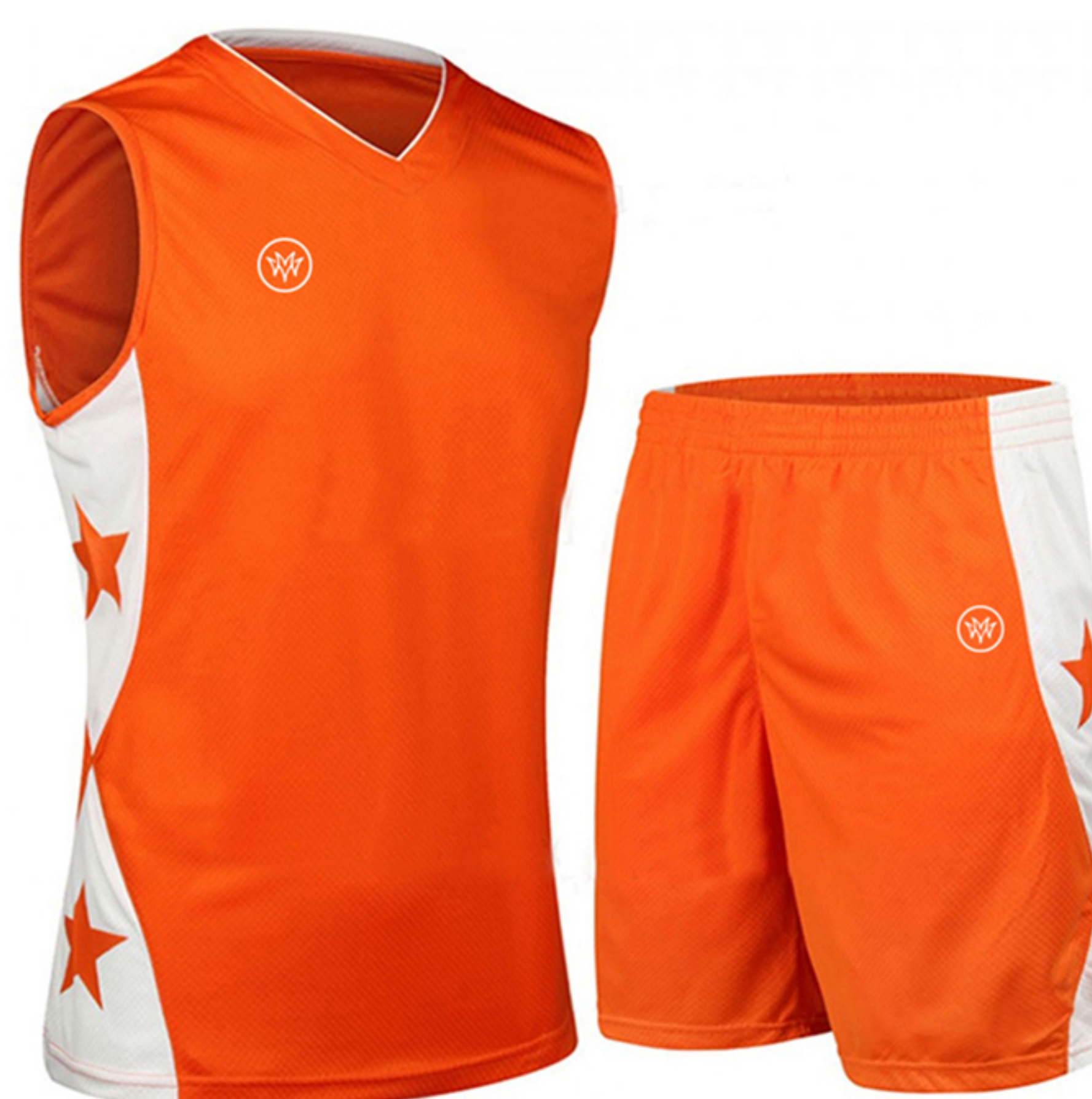
BASKETBALL UNIFORMS MM-BU-108